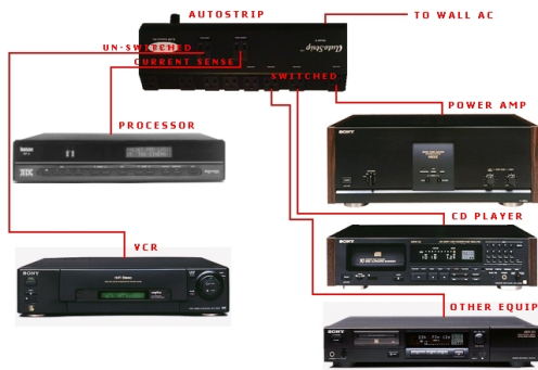
Processor turns system on/off