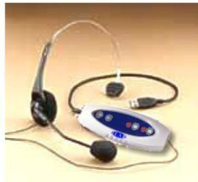
Hardwired USB headphone/microphone application

Note: USB-SP2 is a PCB subassembly. Plastic casing shown for example only and not supplied as standard.